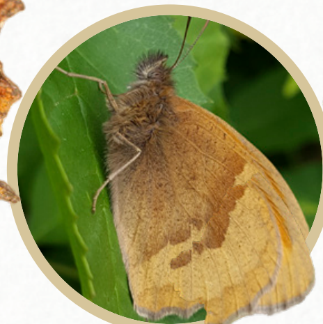
Meadow Brown Maniola jurtina