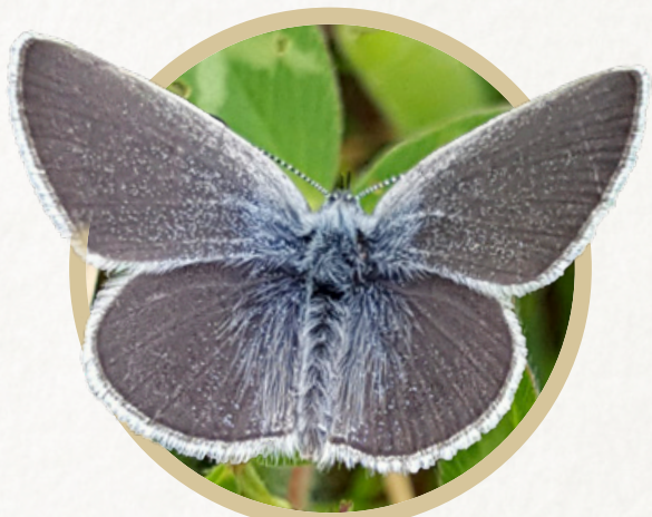
Small Blue Cupido minimus