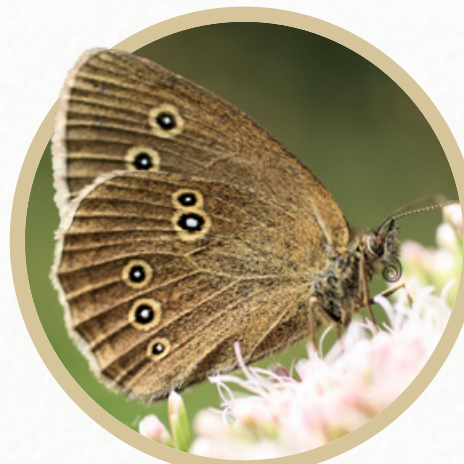
Ringlet Aphantopus hyperantus