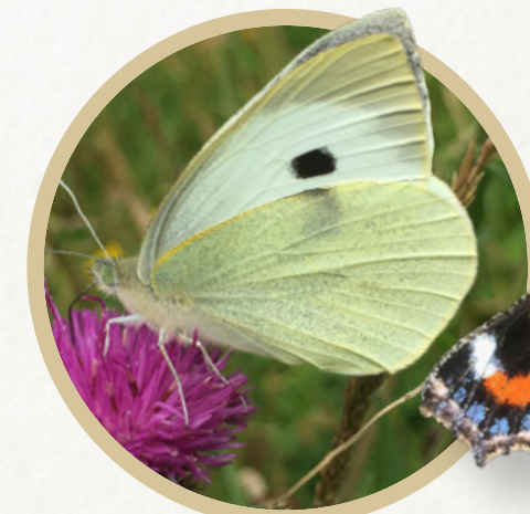
Small White Pieris rapae