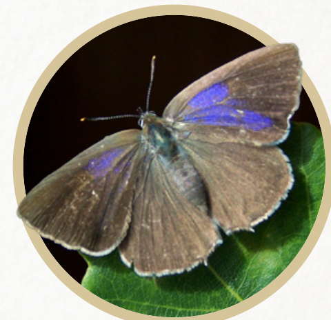
Purple Hairstreak Quercusia quercus