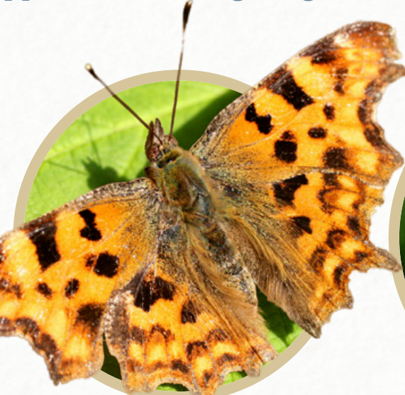
Comma Polygonia c-album