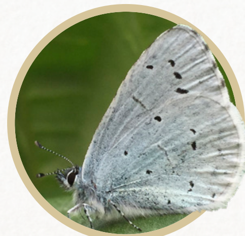
Holly Blue Celastrina argiolus