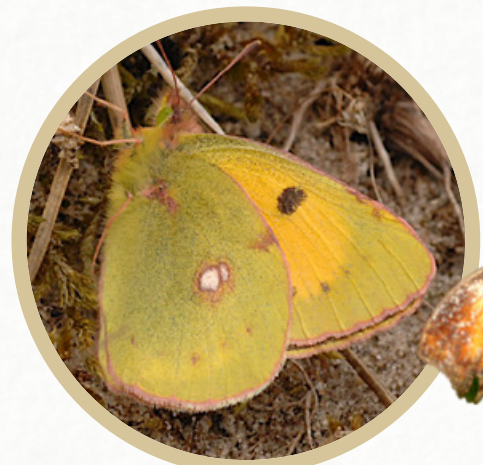
Clouded Yellow Colias croceus