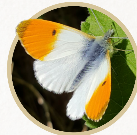
Orange Tip Anthocharis cardamines