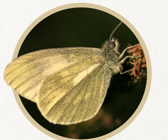
Wood White Leptidia Sp.