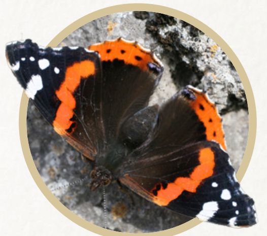
Red Admiral Vanessa atalanta