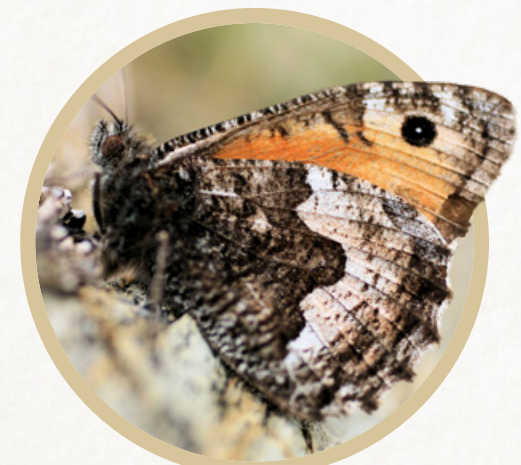
Grayling Hipparchia semele