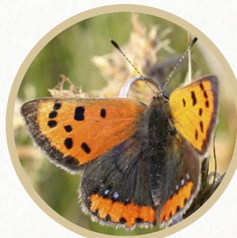
Small Copper Lycaena phlaeas