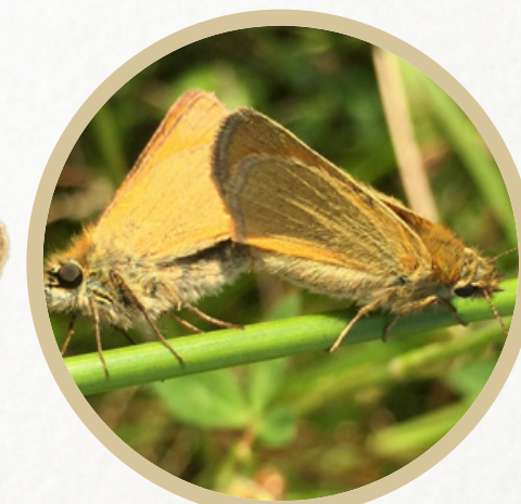
Small Skipper Thymelicus sylvestris