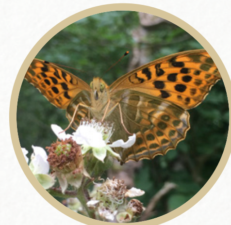
Silver-washed Fritillary Argynnis paphia