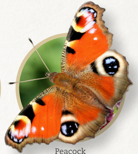
Peacock Inachis io