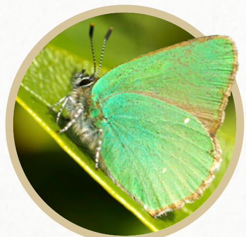
Green Hairstreak Callophrys rubi