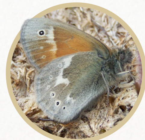
Large Heath Coenonympha tullia