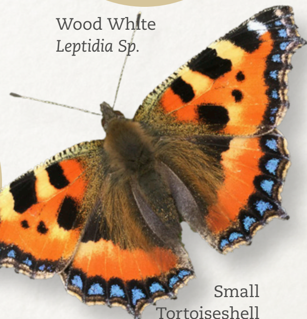
Small Tortoiseshell Aglais urticae