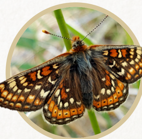
Marsh Fritillary Euphydryas aurinia