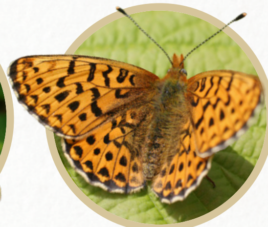
Pearl-bordered Fritillary Boloria euphrosyne