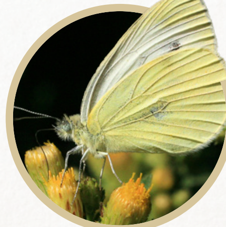
Large White Pieris brassicae