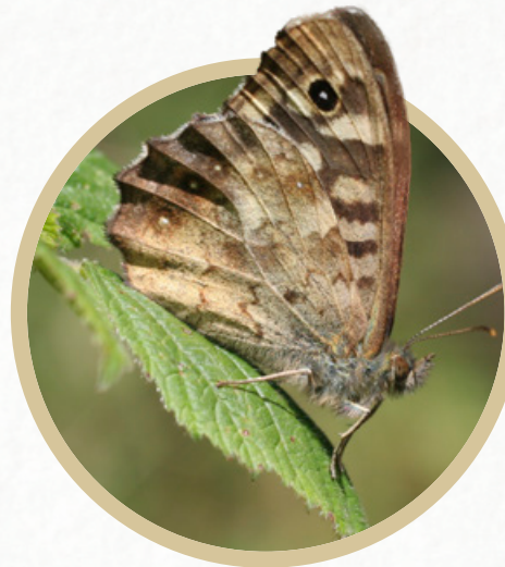
Speckled Wood Pararge aegeria