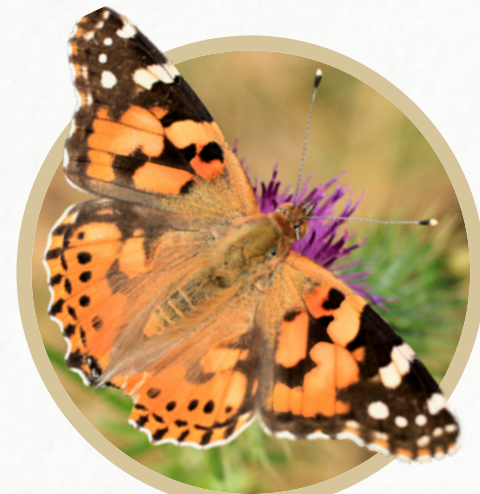
Painted Lady Vanessa cardui