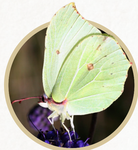
Brimstone Gonepteryx rhamni

Butterflies are an important aspect of Ireland's biodiversity. There are 35 regularly occurring species, 34 of which can be readily identified in the field. The National Biodiversity Data Centre is mapping their distribution and tracking how populations are changing. Help by downloading the free Biodiversity Data Capture App: www.BiodiversityIreland.ie/downloads/apps/ to submit sightings