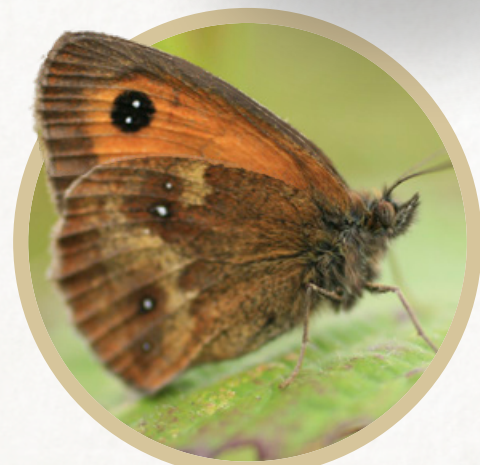
Gatekeeper Pyronia tithonus