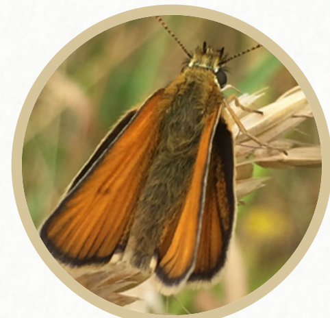
Essex Skipper Thymelicus lineola