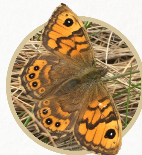
Wall Brown Lasiommata megera