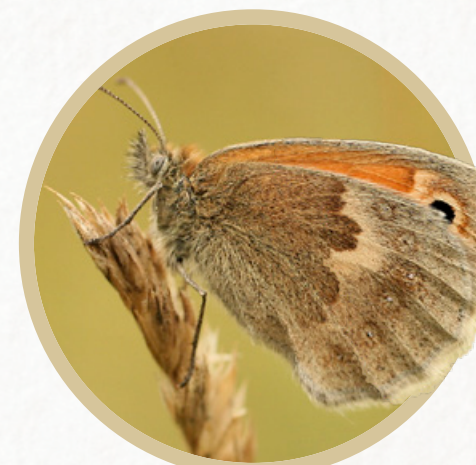
Small Heath Coenonympha pamphilus