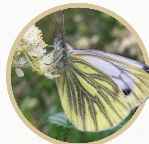
Green-veined White Pieris napi