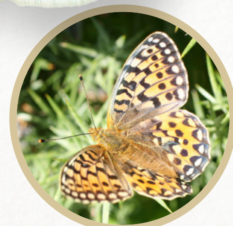
Dark Green Fritillary Argynnis aglaja