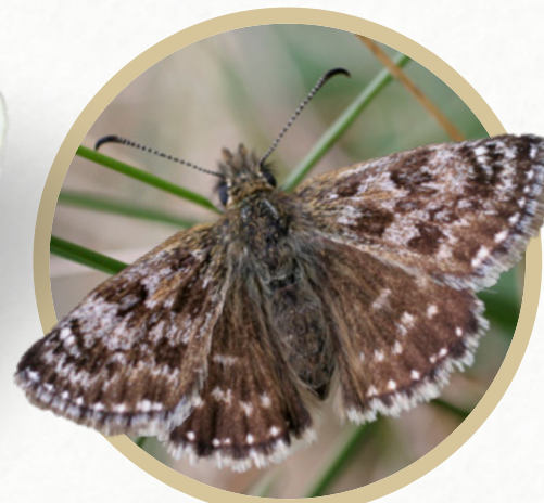
Dingy Skipper Erynnis tages