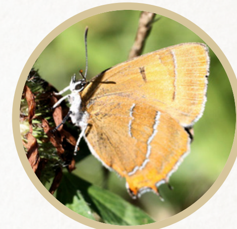
Brown Hairstreak Thecla betulae